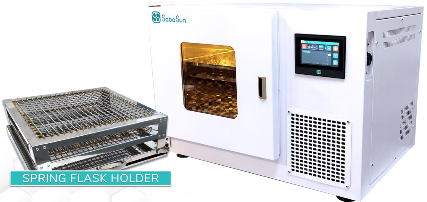
SPRING FLASK HOLDER